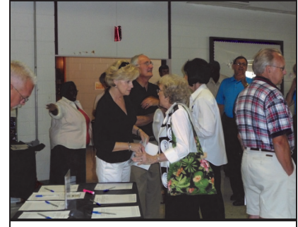
Folks visiting and looking over silent auction items at last year's event.

fantastic choices of household items, gift items, coupons, and travel. Come and give your best