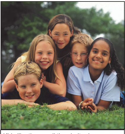
Kids like these call the shelter home

When the OAS Board starting looking at the possibility of adding a new wing for children on a long-term basis, they knew the significant need for this in the state of Arkansas from discussions with the Department of Human Services (DHS) and took a leap of faith. They got a state grant and a federal low-interest rate loan, and were confident of a government contract from DHS that the shelter can apply for every four years. Then the winds changed. The building